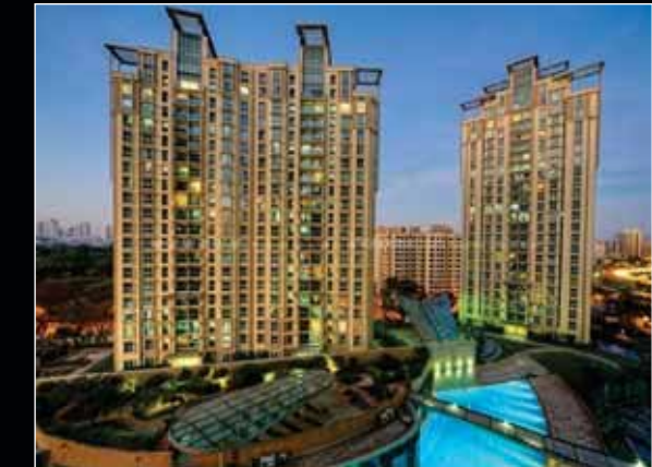
VASANT LAWNS, THANE