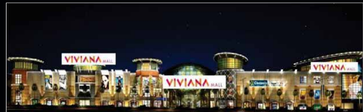
VIVIANA MALL, THANE